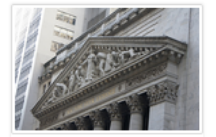
How to Analyze Stocks